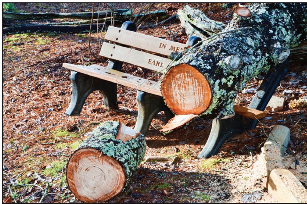
This memorial bench at Hamilton Gardens was heavily damaged when a tree fell on it during the Jan. 11 winter storm.

"They took care of it (last week), and they worked all afternoon to clear out the damage right there in the